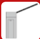
ASB-6010 barrier, right-hand installation

FM 868.8 MHz: item no. 7608V001 FM 434.42 MHz: item no. 7628V001