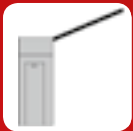
ASB-6010 barrier, right-hand installation

FM 868.8 MHz: item no. 7608V001 FM 434.42 MHz: item no. 7628V001