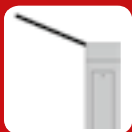
ASB-6010 barrier, left-hand installation

FM 868.8 MHz: item no. 7608V001 FM 434.42 MHz: item no. 7628V001