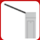
ASB-6010 barrier, left-hand installation

FM 868.8 MHz: item no. 7608V001 FM 434.42 MHz: item no. 7628V001